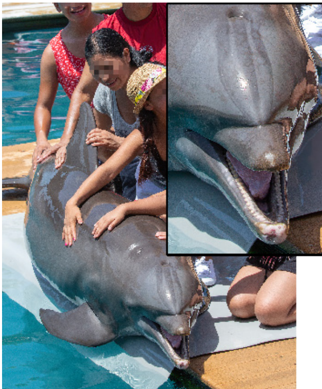
Figure 6. Posing with wildlife has been condemned around the world (e.g., Cerullo, 2017), yet many aquariums and zoos continue to sell this experience and promote it as a way to create a ‘bond’ to the animal for the public. The message this type of interaction gives, however, is not one of conservation and likely helps to promote inappropriate behaviour with wild dolphins (see Figure 5). This dolphin, held in a pen at Miami Seaquarium is required to come out of the water regularly (at least daily) and maintain its position (including holding its mouth open) in the tropical heat of Miami, USA. It shows signs of compromised welfare: its skin is drying out (paler grey area on melon); its teeth are worn to the gums; and it has an open wound on the end of its mandibles (see overlay image which is close-up section of main photo).

experts and the like, will often imitate the modeller. This results in cultural transmission or social learning. Through entertainment shows and interaction ‘experiences’ with marine mammals, the industry normalises behaviours that are often harmful to the marine mammals and undermines conservation messaging. Therefore, rather than being educated about conservation, customers are taught that it is acceptable to ride on, stand on, pat, approach close to (Figure 6) and even feed marine mammals. Such behaviour is damaging in its first instance for the individual animal involved in the captive pay-to-participate activity, but it also has secondary effects as it encourages inappropriate behaviour in the wild, especially if the viewer then attempts to emulate what they have seen during one of these captivity events. It is a fair question to ask then, why most of these same activities, that are deemed ‘acceptable’ in captive facilities, are illegal if conducted in the wild?