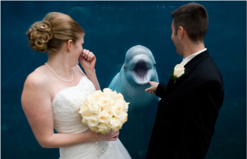
Figure 10. The 'normalisation' of interacting with marine wildlife is big business. The Mystic Aquarium, Connecticut, USA and the associated 'Ocean Blue Catering' offer "A lovely setting next to our Beluga Whales for wedding ceremonies, cocktails and hors d' oeuvres" and state that "Dining amongst the world's most interesting sea creatures is priceless. There is a real romance that is associated with the sea, and being on the same level with these creatures adds to its allure." They also sell beluga themed birthday parties for children aged 7-13 (with or without pizza).

More than 100 psychologists have noted concern over the consequences for children who attend circuses and other shows in which animals are improperly kept and used. They note that such exposure;