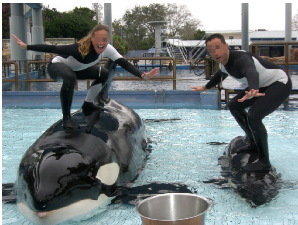
Figure 1. The mixed messages exhibited by some facilities are clear. Here, two higher-echelon trainers mimic 'surfing' on two orca forced into shallow water at SeaWorld Parks & Entertainment in Orlando, Florida USA. The younger orca (right) not only has its blowhole nearly submerged, but the spine, neck and skull are not fully developed at this young age (the calf was approximately 1.5 years old during this event and as such skeletal structures were potentially impacted by the weight of an adult male human standing on her). Normalising harmful interactions such as this contradicts the PR of respect, kinship and bonds as well as any conservation messages. It may also have spillover effects with interactions in the wild and draws into question the management cultures of facilities, as well as the fee-based and industry-driven associations which find practices such as this acceptable. Photo supplied to authors ( circa 2009).

The dichotomy between principle and income plagues every business sphere and as such it is not a new phenomenon, or one unique to the field of wildlife conservation (Watson, 2017). Wildlife (in these examples marine mammals), unlike their human counterparts, have no direct recourse of their own and should not bear the costs of putting 'box office' proceeds/income before principle. Captive facilities ask that marine mammals under their care be ambassadors for the species; accordingly, it is only fair that facilities be ambassadors of how to treat marine mammals with respect and dignity.