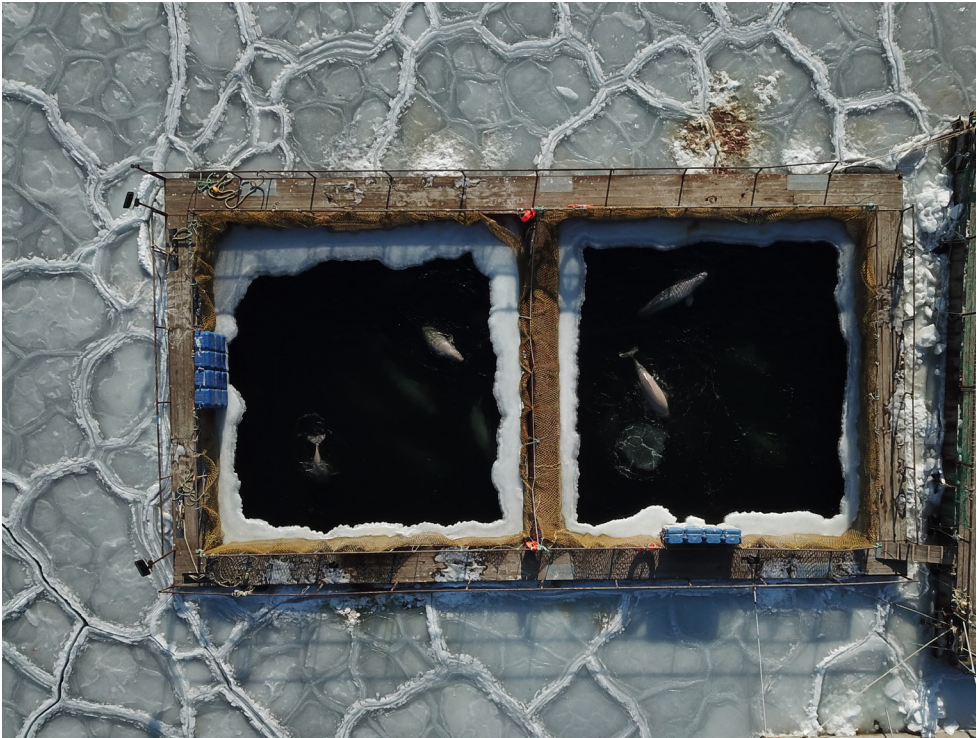
Figure 16. At least ten belugas are held in these two pens. The ice around the outside of the pens is packed tightly whilst the water inside the pens is kept 'open' due to the surfacing of the belugas. These pens were approximately 9x9m and only 4.5m deep (TWSP, unpublished data). The air temperature during the period this photo was taken (Jan 2019) was -17 to -7°C.

Due to global outcry over the situation, the Russian Government invited an international team of marine mammal experts, convened by the Whale Sanctuary Project, including ocean explorer Jean-Michel Cousteau, to evaluate the health and welfare of the animals (Anon., 2019b; Anon., 2019c) and make recommendations for their rehabilitation and release. Upon their arrival, the expert team observed that the animals showed signs of compromised welfare including physical (injuries, pathogens) (e.g., Figures 17 & 18), and behavioural (stereotypies etc) issues (TWSP, unpublished data). The experts negotiated an agreement, that was co-signed by the Russian Government, recommending that the animals be released back into their native habitat (Daly & Antonova, 2019). This was eventually completed in November 2019 (Katz, 2019; Daly, 2019). Despite the agreement, the operation did not incorporate the most critical recommendations from the experts (TWSP, 2019) and 50 belugas were not released back into the area where they were captured (Cousteau & Vinick, 2019).