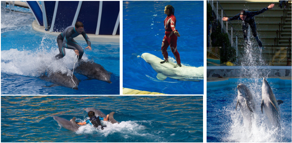
Figure 11. Riding on, being dragged by, or propelled through the air by marine mammals is typical in most industry shows around the world. These actions place undue stress on the animals' and there is no appropriate conservation message that can be given during such displays, yet they persevere. Clockwise from top left, trainer stands on a beluga, Beijing Zoo, Beijing, China (2018); trainer is propelled through the air by two dolphins, Marineland Antibes, Antibes, France (2016); trainer dragged through the water by two bottlenose dolphins, Sea World Gold Coast, Southport, Australia (2016).