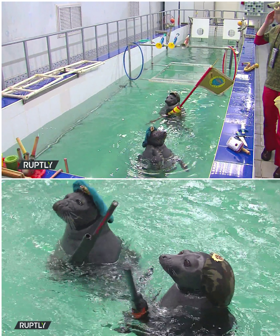
Figure 13. Baikal seals ( Pusa sibirica ), at the Nerpa Aquarium in Irkutsk, Russia perform in an indoor tank no more than 2 x 10m ( top ). There, in front of paying visitors they are forced to paint pictures, play fake musical instruments and clasp replica guns while wearing berets with the hammer-and-sickle insignia ( bottom ).

At times it seems as if the bounds of decency know no end. In Figure 13, seals perform demeaning and irreverent pantomimes in military 'costumes', complete with replica guns, all while in an incredibly small tank indoors at the Nerpa Aquarium in Irkutsk, Russia.