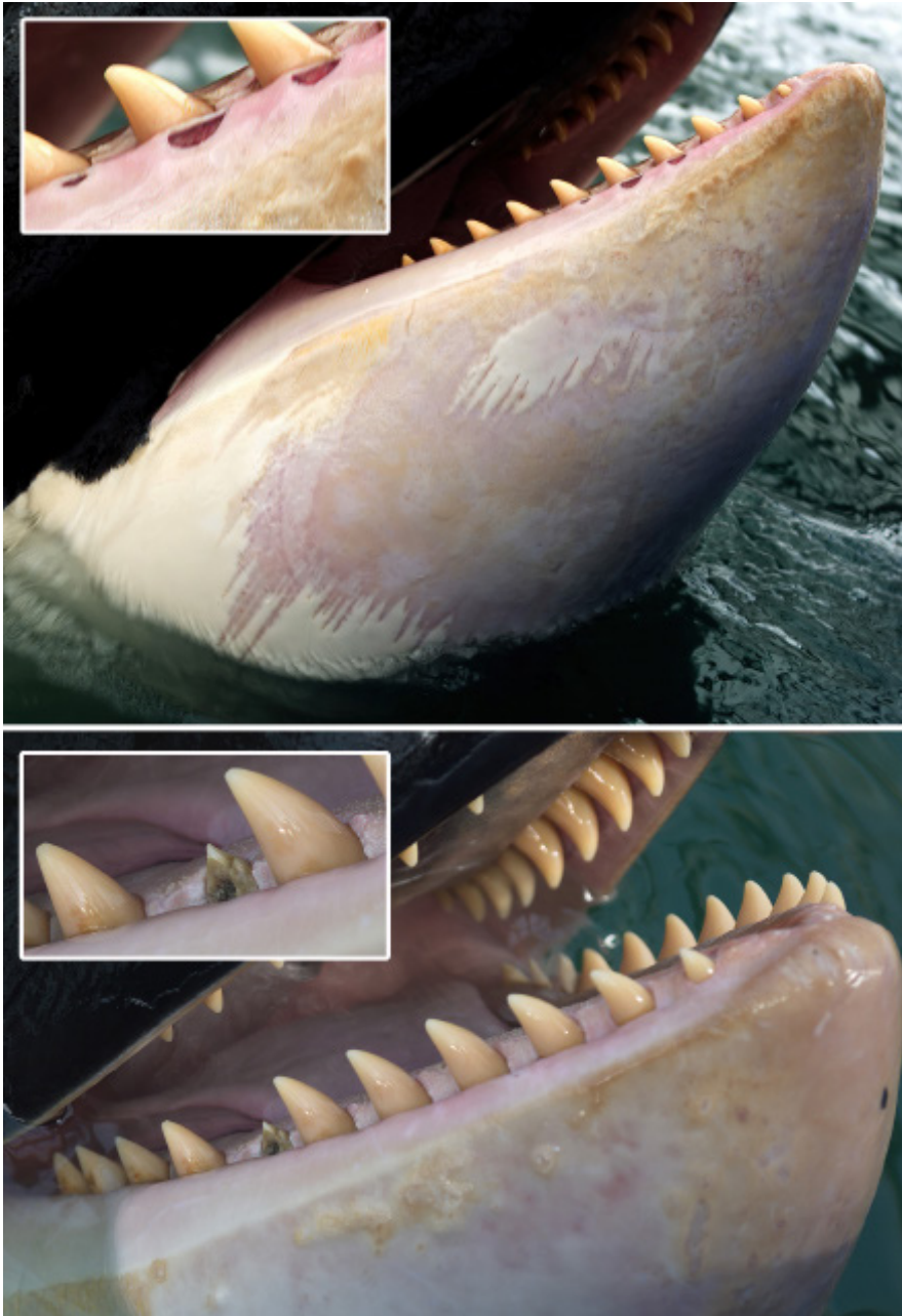
Figure 17. Two of the 10 orca held in the ‘Whale Jail’, Russia. Top. The epidermis was missing over much of the gular region of this orca from an undisclosed event(s) whilst held at the Whale Jail and skin pathologies are also visible (discoloured and raised areas on mandible). Insert shows wounds beside the teeth created by the orca repeatedly grasping the pen nets (TWSP, unpublished data). Bottom. This orca had various skin pathologies as well as a broken tooth with exposed pulp which was left untreated (insert). In most captive facilities such a tooth would undergo a modified pulpotomy procedure, where the primary objectives would be pus drainage, removal of diseased pulp tissue and clearing of impacted food and debris (Jett et al., 2017), or the tooth would be removed.