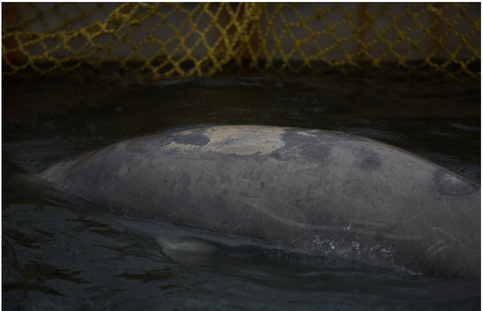
Figure 18. Two of the 87 beluga held in the 'Whale Jail', Russia. Top. A very young beluga exhibits multiple issues, including deep cuts to the upper 'lip' area of unknown etiology and wrinkled skin (indicative of dehydration). Bottom. This beluga shows signs of fungal or other skin pathogens (circle patches) as well as peeling epidermis (pale area on middle of back) from potential 'frost bite' due to the extreme low temperatures it was exposed to while held in tiny pens without appropriate protection (see Figure 16).