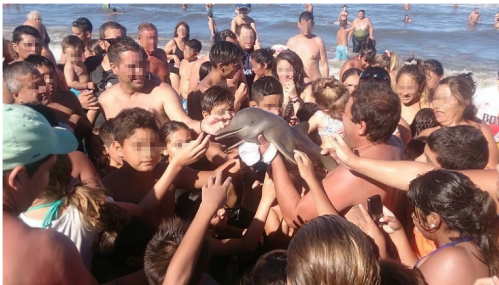
Figure 5. In February 2016, two La Plata dolphins were found near a popular beach, Argentina. Lifted out of the water and passed around for photographs, at least one of the two died during this incident. The next year, not far from this location, another dolphin was killed in a similar manner (Bale, 2017) and in the same year another young dolphin died in Mojácar in southern Spain when tourists caught it in shallow water and took photos as they lifted it out of the water (Carr and Broom, 2018). The promoting of 'selfies' and 'posing' with wildlife that many aquariums and zoos sell is likely contributing to such obsessions and as such more responsible messaging should be implemented.

“... the public is less likely to consider chimpanzees as endangered compared to other great ape species. This phenomenon was linked to the prevalent use of chimpanzees in movies, television shows and advertisements, where chimpanzees are often inaccurately displayed. These results were the first to link the manner in which chimpanzees are portrayed in popular media to public attitudes that may influence support for critical in-situ conservation efforts.”