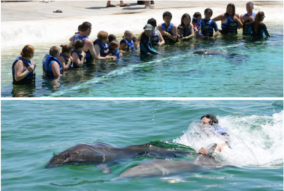
Figure 7. Top. Nineteen tourists line up for an in-water encounter with cetaceans at Sea Life Park Hawaii, USA. Such experiences, depending on the extent of the interaction, range from approximately US$150 to $200 per person (as of September 2020) and last for 30 minutes. The online schedule indicated they were offered three to four times a day at this facility. Bottom. A tourist during a swim-with program at the same facility is dragged through the water by a bottlenose dolphin (near camera) and a ‘wholphin’ (a captive bred hybrid between a false killer whale ( Pseudorca crassidens ) and a bottlenose dolphin).