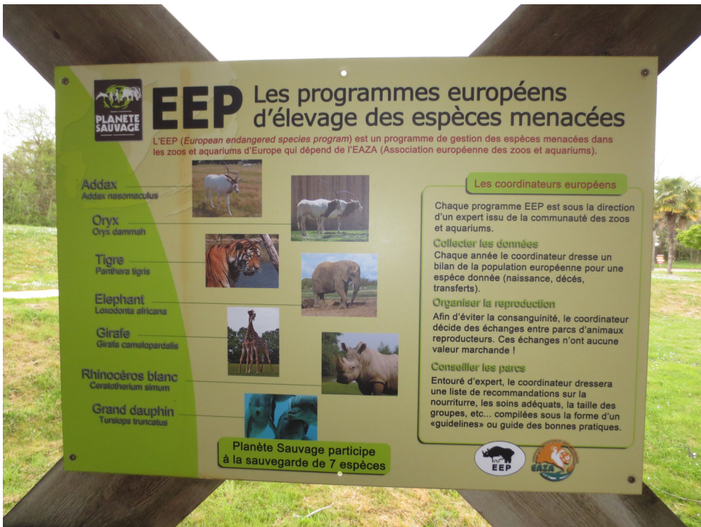
Figure 4. A sign displayed in 2016 (and subsequently removed), at Planète Sauvage in Port-Saint-Père, France, prominently listed bottlenose dolphins ( Tursiops truncatus , “Grand dauphin”) as part of the facilities breeding program for the European Endangered Species Program (EEP), run by the European Association of Zoos and Aquaria. The other species featured on this sign were on the spectrum of ‘endangered’; Addax (critically endangered, IUCN 2016), oryx (extinct in the wild, IUCN 2016), tiger (endangered, IUCN 2014) Giraffe (vulnerable, IUCN 2016), white rhino (near threatened, IUCN 2020). However, bottlenose dolphins, although classified as Appendix II under CITES, were not endangered and, rather, were listed as ‘Least Concern’ by the IUCN in their ‘Red List’. The species last assessment was in 2018 and their status remains unchanged. Such portrayal of a species by a facility misleads the public into believing that the species is endangered. By default, it implies that it is therefore appropriate to breed them in captivity (for example the sign above states that this facility “contributes to the safeguarding of 7 species”). It also subtly suggests by association with these genuinely Red Listed species that offspring are released into the wild as part of a conservation program. Yet, globally, no bottlenose dolphins born in captivity have been released (although a small number of individuals who were born in the wild and taken into captivity have since been rehabilitated and released back into the wild).

“Explore the ocean’s most loved creatures during this deep-water experience. You’ll have approximately 30 minutes to share all sorts of behaviors, including kisses, handshakes, rubs, training techniques and feeding your new friend. The experience is highlighted by an awesome dorsal pull.” (Miami Seaquarium, 2020).