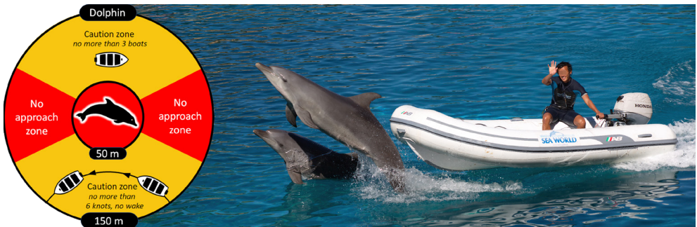
Figure 12. At Sea World Gold Coast, Australia, a small boat powered by an outboard engine is run at high-speed during a show. This activity provides the wrong messaging as it actively encourages bad boating behaviour when interacting with wild dolphins. Typically, regulations for marine mammals require travelling at slow speeds when in close proximity to dolphins, to avoid propeller cuts and boat strike. In Queensland, the rules include (but are not limited to) not approaching within 50m, travelling with no wake and at no more than 6 knots (11km/hr) and to not approach from directly behind the animal (diagram, insert , Queensland Government). All of these rules are broken during this show. Additionally, at the point the photo was taken the trainer was focused on the audience, not the dolphins.

At least one facility (Sea World Gold Coast, Australia) uses a fast-moving boat to 'entice' dolphins to bow-ride at speed during its dolphin show, effectively telling the public 'if you want dolphins to play with you, drive your boat fast' (Figure 12). Once again, there is no conservation messaging and certainly nothing in the narration or actions that draw attention to respect and consideration for dolphin mothers and calves, resting individuals