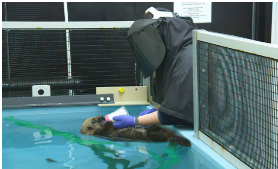
Figure 2. When young sea otters are rescued in the Monterey Bay area, appropriate protocols for interactions are utilized and maximise the potential for return to the wild. Caregivers at the Monterey Bay Aquarium, California, USA, wear what is affectionately termed the "Darth Vader" suit, so that the young sea otter does not imprint or associate a positive experience with humans. This is in stark contrast to the bottle feeding done at some facilities breeding animals (see Figure 3). Furthermore, the sea otter pups are placed with surrogate adult sea otters, before being released, in order for them to learn how to forage, groom and generally survive like a wild otter.

The rescue, rehabilitation and release of one of its most famous alumni, otter “501” was chronicled in a feature film “ Saving Otter 501 ” (Shelly and Talbot, 2012; Spiegl, 2012). Since 2001, the facility has released over 100 rehabilitated sea otters back into the wild (many tagged with transmitters and flipper tags to facilitate long-term monitoring), including 37 surrogate-reared pups utilizing a stringent protocol for human interactions (Hetter, 2019), (Figure 2).