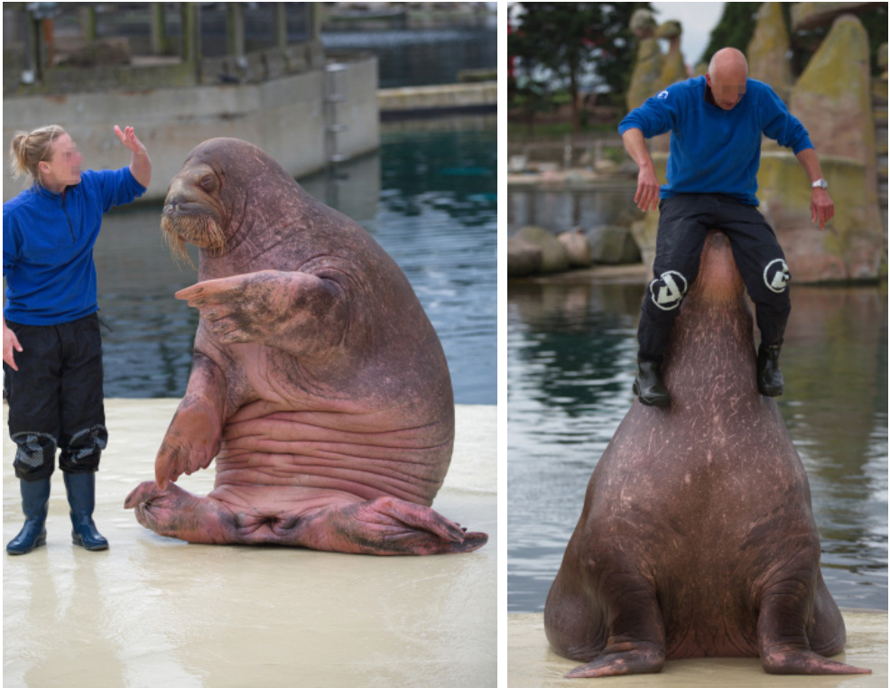
Figure 9. At a number of facilities, such as Dolphinarium Harderwijk in Harderwijk, Netherlands, animals are portrayed as comical characters or ridiculed in some way. In this case a walrus is mocked for its size and blubber (despite these being natural attributes of an adult walrus), all the while being required to do unnatural 'sit-ups' (left) and another is required to lift people by having them sit on his face (right).

The next level of objectionable messaging is reached when trainers ridicule the animals by commanding them to perform demeaning tricks (e.g., 'sit-ups', 'break-dancing' etc., Figure 9), often accompanied by loud popular music.