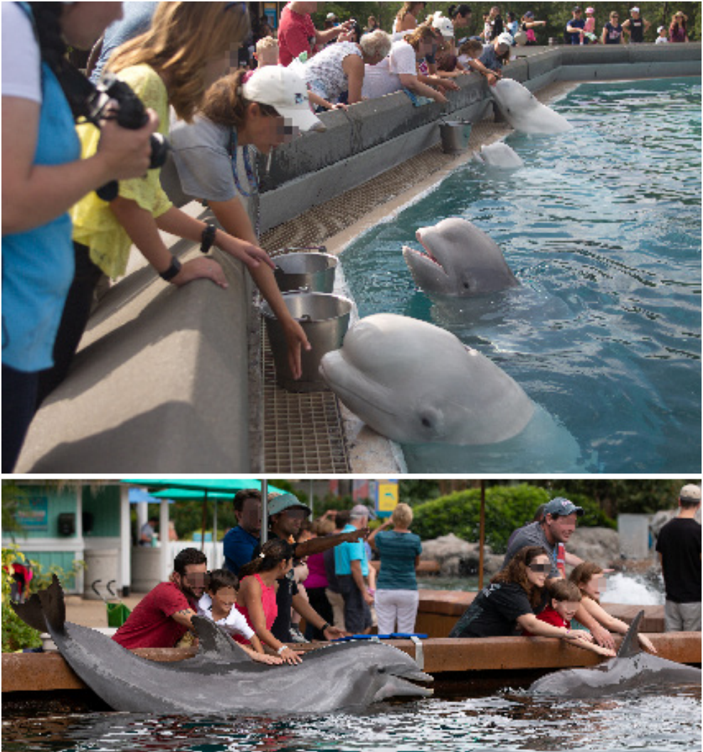
Figure 14. Top , At MarineLand, Niagara Falls, Canada, during one beluga feeding session more than a dozen people were participating (the three trainers were wearing white hats and sunglasses) and more than 20 were lined up buying tickets (background); Bottom , At SeaWorld Orlando, USA, during one bottlenose dolphin session seven people were participating, with two other similar sized groups interacting with other dolphins in the background. Note the trainer (centre wearing hat with hand raised), is directing the clients to look at the photographer.

However, at times these regulations lag behind the current science, they do not give enough direction, and/or there is a wide variation of standards between countries (Hassan, 2016; Rose et al., 2017). Additionally, a number of countries' violations of wildlife protections are met with lax enforcement (e.g., see the International Consortium on Combating Wildlife Crime, 2009 and Sina et al., 2016) and as such, even countries flout the rules (e.g., European Commission 2011), setting poor examples for the facilities