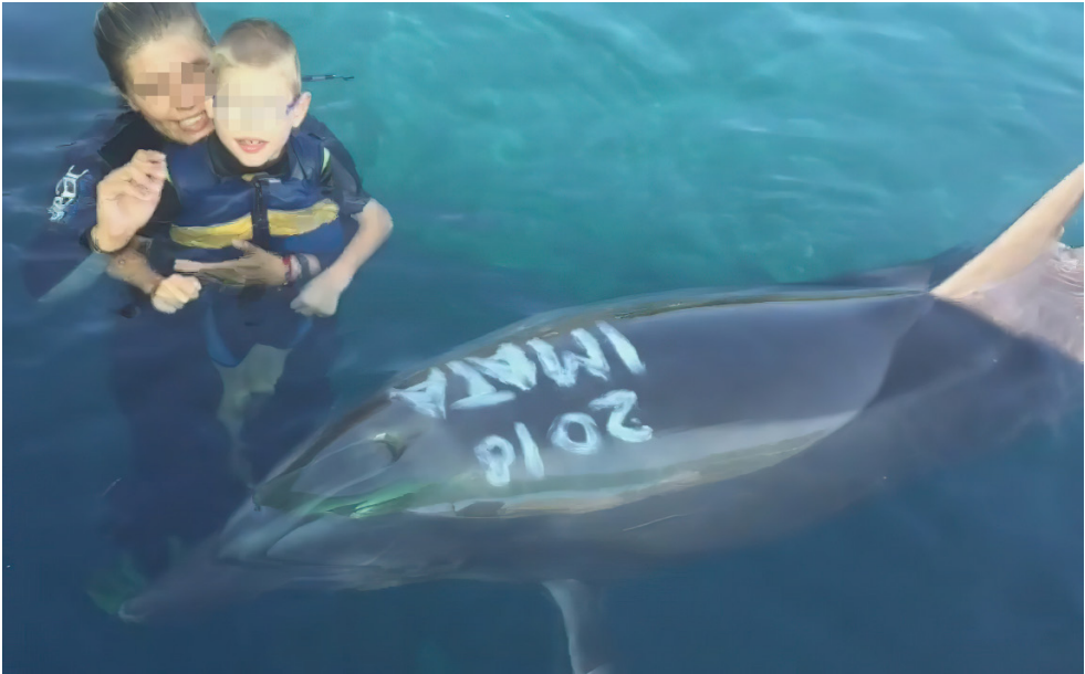
Figure 8. During a ‘swim-with’ encounter, a dolphin was used as a ‘living billboard’ when it was painted with the text ‘2018 IMATA’. We concede that the paint may be non-toxic (although we have no information either way), but the messaging is not. The messaging that it is ok to use an animal in this way was evident at the time and when video of this event was used as part of the promotion of the IMATA Annual conference. IMATA notes that “Each year, a remarkable, fun and entertaining musical compilation is created from video footage submitted from organizations around the world and then debuted at the Annual IMATA Conference.” (photo; IMATA, 2020).

members exercise “the highest levels of respect and humaneness for all animals” (IMATA, 2020b). Nevertheless, despite their narrative, some trainers are seen to publicly mistreat these same animals, thereby teaching children that, for example, using a dolphin as an advertising ‘billboard’ by writing on it (Figure 8), or riding on the backs of wildlife (for instance, IMATA’s home page (Sep 2020c) features a trainer standing on and ‘surfing’ on two fast-swimming dolphins), is acceptable behaviour.